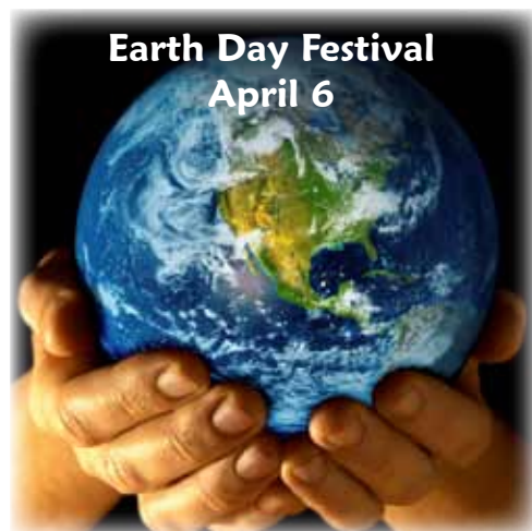
Earth Day Festival April 6